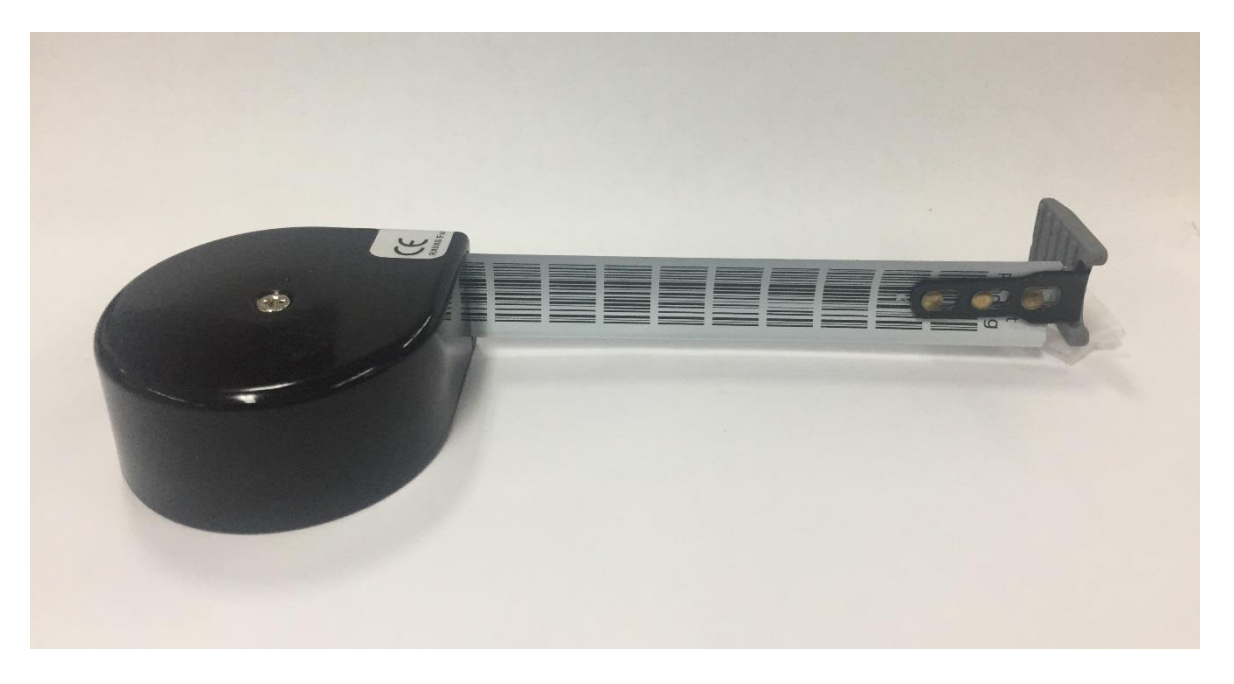
(a) C190T-C-O Retractable Barcode only tape cassette (Variant 5)