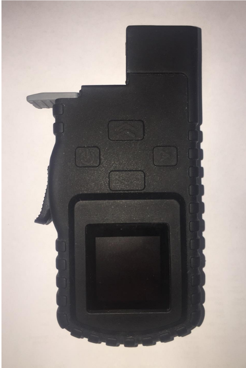
Cubetape model CSN110 ScanTape™PRO May also be known as C190 PRO (Variant 4)