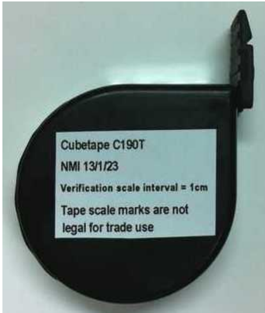
FIGURE 13/1/23 – 3