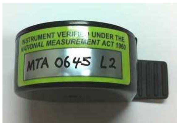
ParcelTools Australia Model C190T Replacement Tape Cassette (Variant 2)