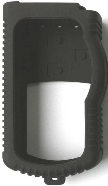
(a) Rubber Protective Cover (Black)