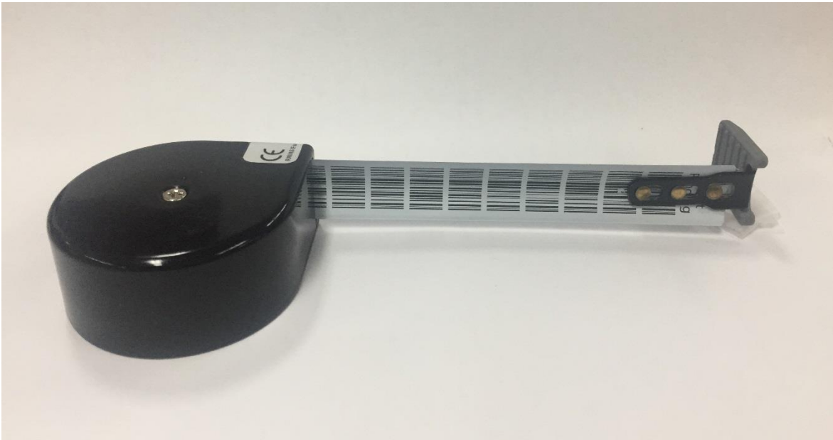
(a) C190T-C-O Retractable Barcode only tape cassette (Variant 5)