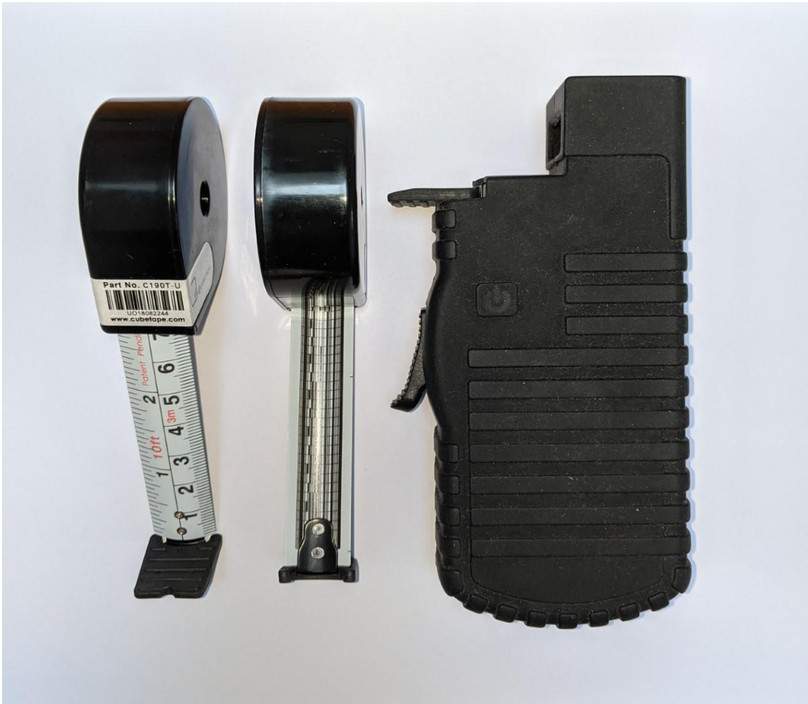
C190POS with C190T-U tape cassette (Variant 6)