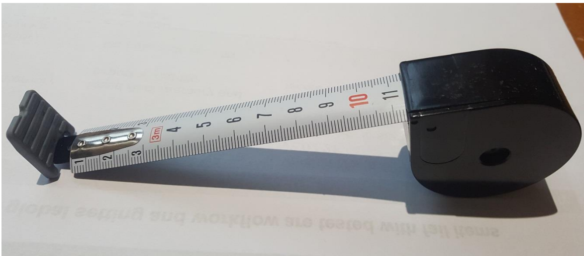
(b) C190T-C Retractable Barcode tape cassette with human readable scale markings (Variant 5)